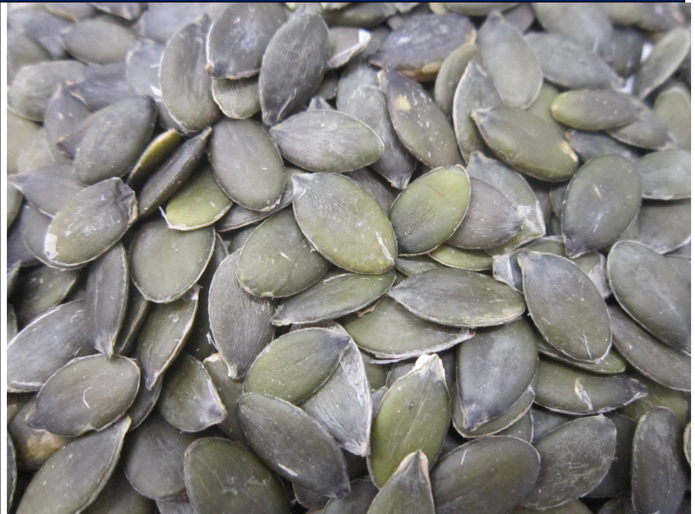
Typical Example of Raw Material