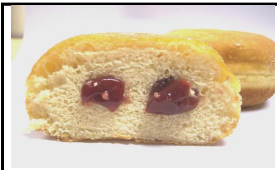
Internal Structure Photo